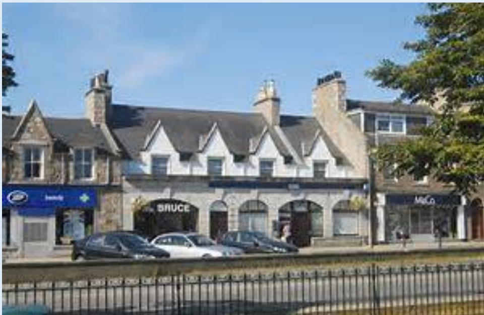
Inverurie, Market Place

Inverurie has continued to grow over the years and has a large commuter population. It is the “fastest growing town in Great Britain”. It is served by four primary schools (one newly built 2017) and a special needs school (St. Andrew’s School). It is served by Inverurie Community Hospital with a new state of the art Health and Care Hub due to open summer 2018. Work has started to build a new academy and swimming pool and plans are well underway to expand the local sports centre facilities.