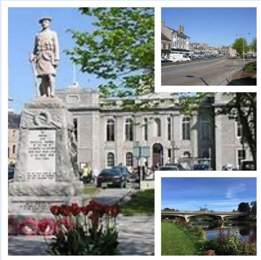
Inverurie War Memorial and Town Hall, High Street and River Don

For children of all ages, many opportunities exist to support both sport and hobbies alike. There are Scouts, Girl Guides, Boys Brigade, local junior football and junior rugby teams, swimming clubs, and many other opportunities through school based and independent and local organisations.