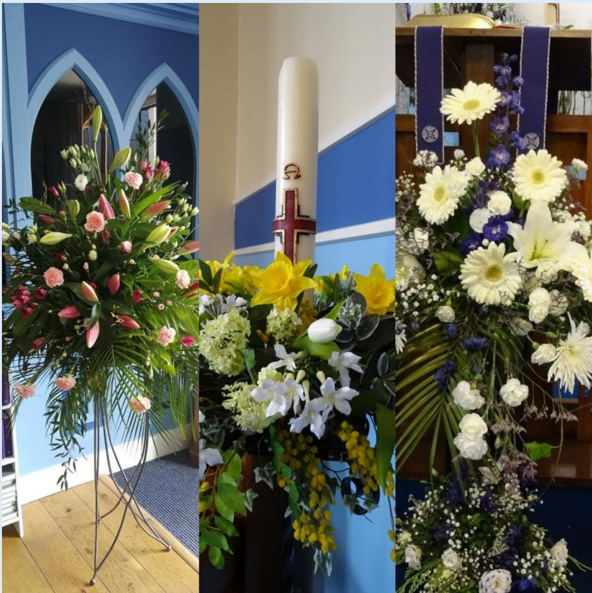
Flower displays around the church