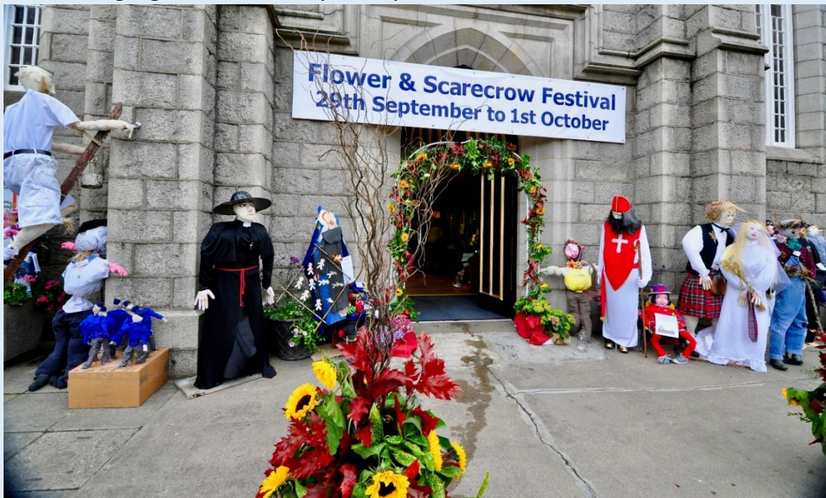
Scarecrows outside St Andrew's Church during the festivities