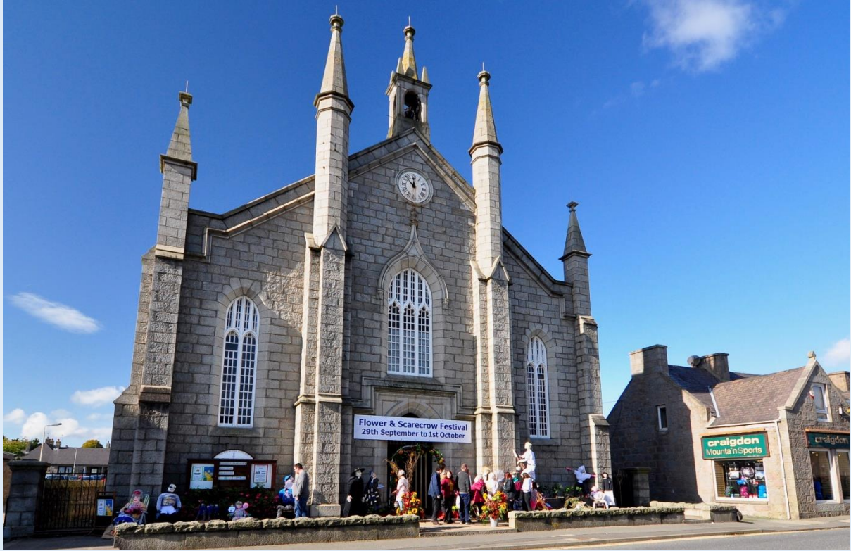
St Andrew's during the flower festival