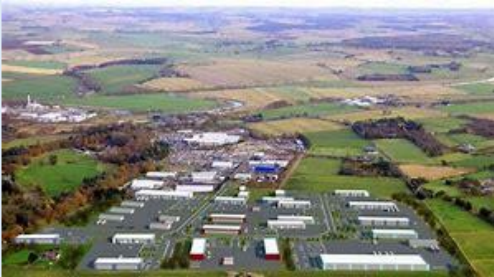
Aerial view of mart and Business Park

Inverurie has continued to grow over the years and has a large commuter population. It is the “fastest growing town in Great Britain”. It is served by four primary schools (one newly built 2017) and a special needs school (St. Andrew’s School). It is served by Inverurie Community Hospital with a new state of the art Health and Care Hub due to open summer 2018. Work has started to build a new academy and swimming pool and plans are well underway to expand the local sports centre facilities.