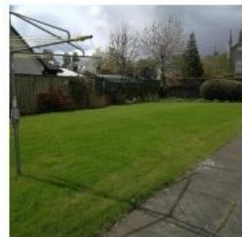
Manse – from the street, indoors, attic room and garden