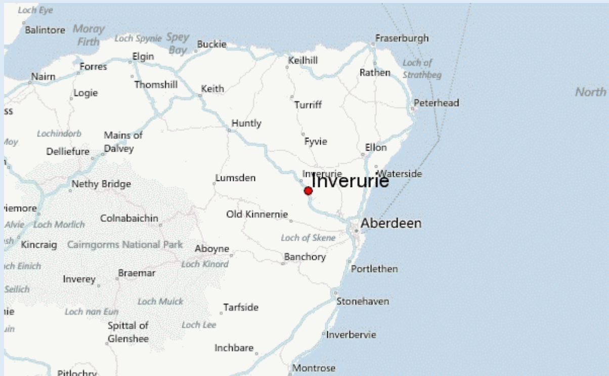
Inverurie and surrounding area

Inverurie is a market town located at the centre of Aberdeenshire and is known locally as the “Heart of the Garioch”. It sits between the Rivers Don and Ury and is 16 miles north-west of Aberdeen. It is well served both by road (A96), rail and the nearest airport is Aberdeen Airport (about 11 miles).