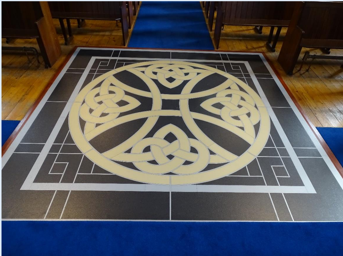
New floor, designed during the renovation work