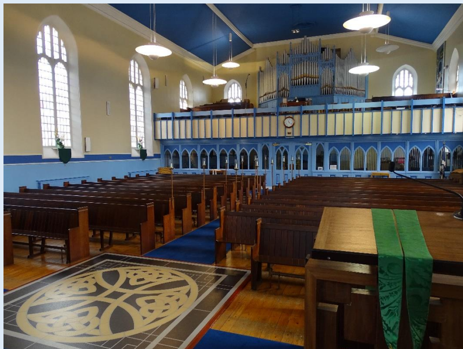
St Andrew's from the pulpit

We have three communion services throughout the year: April and September being carded communions and third communion which is held in June is non-carded.