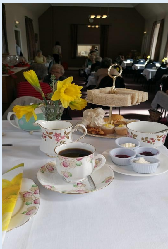
Daffodil tea held in the chapel

There is an active social committee who have organised a number of events on a small and large scale. For example, summer BBQ; fund raising teas and meals including Victorian Tea, Daffodil Tea, Strawberry Tea, Steak Supper, Queen's Birthday Tea; and concerts.