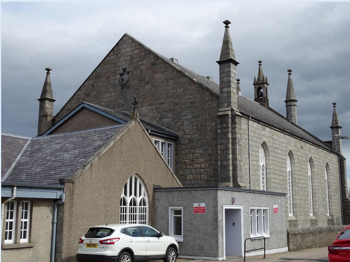
St Andrew's carpark, chapel and old hall