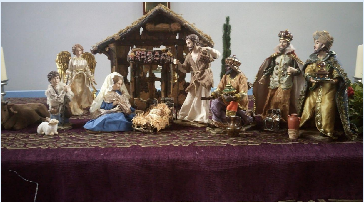
Nativity figures during Christmas service within St Andrew's Church

Christmas Christingle Service (organised through IDCT) are held in St. Andrew's Church. The Watchnight Services are held either in St. Andrew's Church or the West Church. On Christmas Day, St. Andrew's and the West Church have again united, however we also hold independent services.