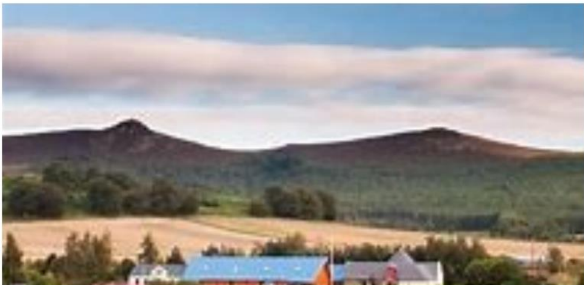
Surrounding countryside and views of Bennachie

Inverurie has many clubs and organisations for the whole community and caters for a wide and diverse demand and taste. Inverurie Loco Works football team are based at Harlaw Park and are in the Highland League. Inverurie also has thriving cricket and rugby clubs based at Kellands Park. There are three bowling centres (indoor and outdoor) and a golf club. There are many opportunities to access clubs and societies throughout the town.