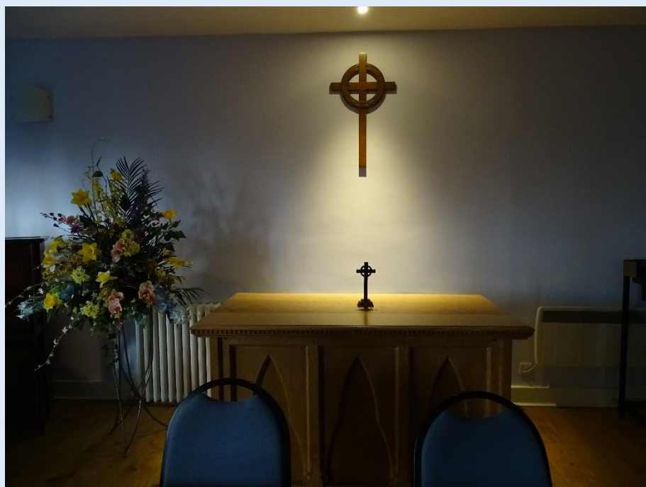
Chapel of St Appolinaris

Both meetings are usually held in the Chapel of Appolinaris.