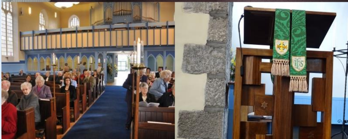
Chapel set out for a meeting, some of the congregation and Lectern